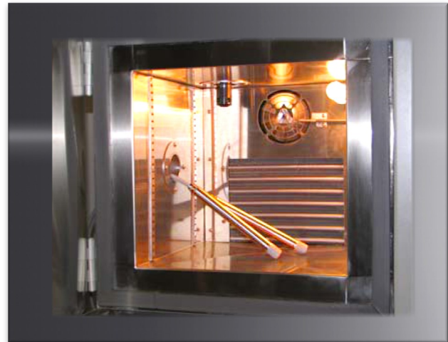
The ELH Calibration Chamber with probes inserted through access port.