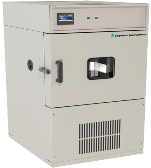
The EHD Calibration Chamber

Included are RS232, Internet, IEEE488 interface options.