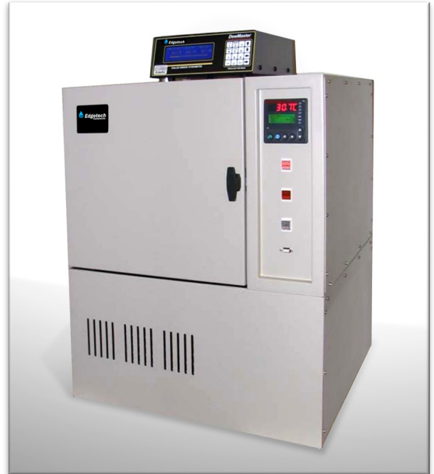
The ELH Calibration Chamber with DewMaster Chilled Mirror Hygrometer